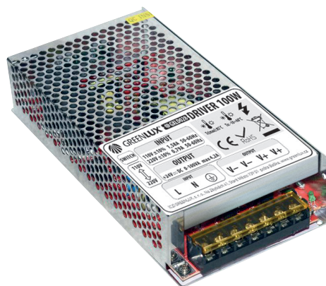
DRIVER LED 24V IP20 100W