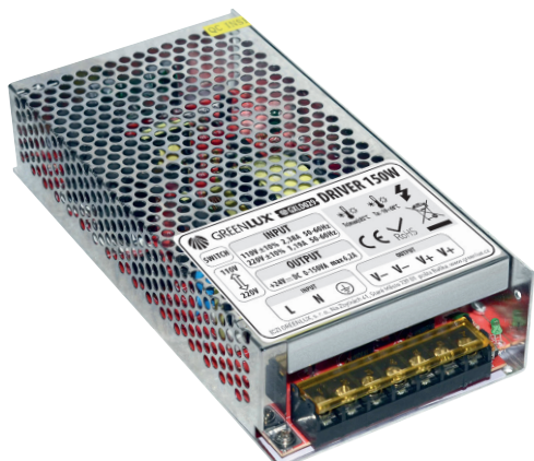
DRIVER LED 24V IP20 150W