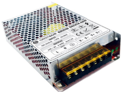
DRIVER LED 24V IP20 60W